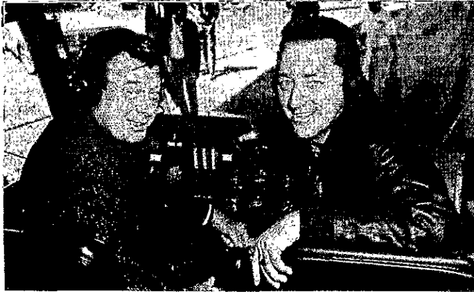
Arthur Godfrey, a versatile pilot, at the controls of the Goodyear blimp.

"Well, there's darned well something up here," Godfrey responded.